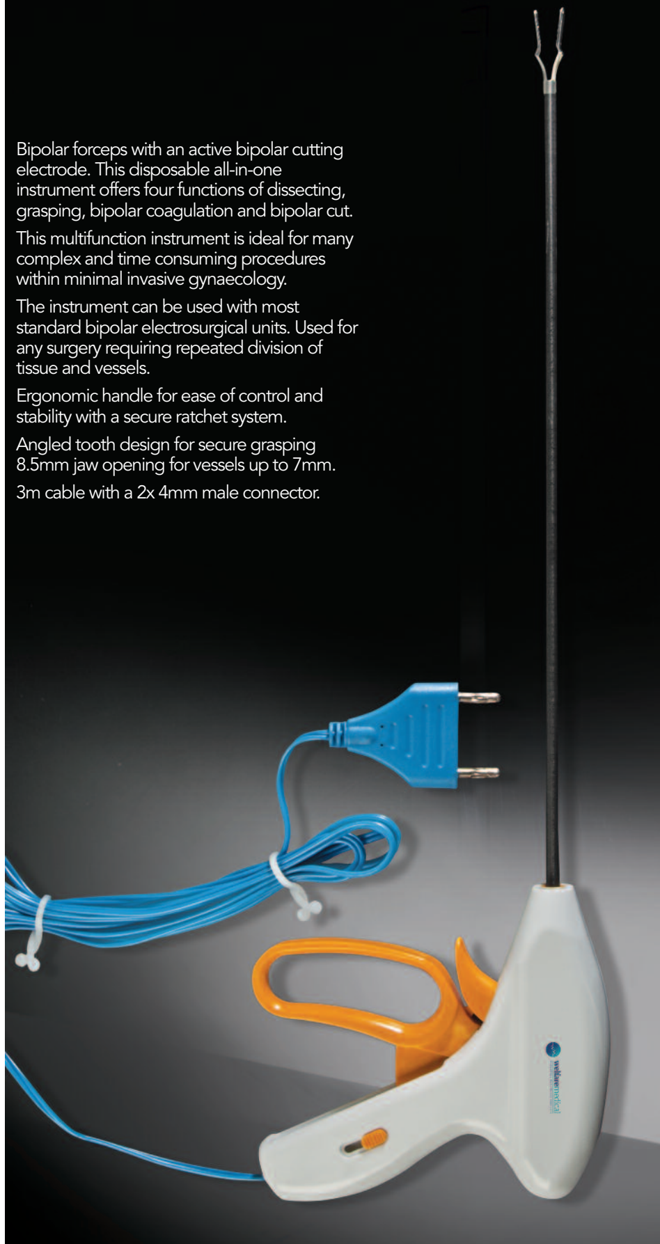
Disposable Bipolar Forcep with Cutting Electrode